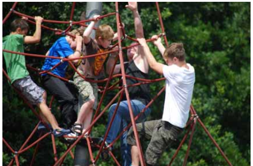
Youth Council Members at Markeaton Park

The design includes a Social Fitness Zone, a Cyclogym, a Dynamic Zone, a Ball Games Zone and an area called The Legacy which is a multi-level climbing area. Youth Council members were particularly impressed with an online coaching facility that can be accessed by their mobile phone cameras.